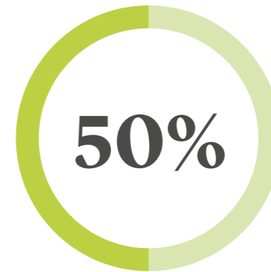
of employees take time off work due to an elderly care need for a loved one

With the number of people requiring care and support increasing, the potential impact upon the workplace also faces considerable increase. Research shows us that: