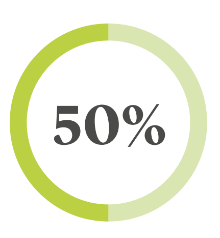
of employees take time off work due to an elderly care need for a loved one

With increasing numbers of adults needing care and support, the potential impact upon your life and work also faces considerable increase. Research shows us that: