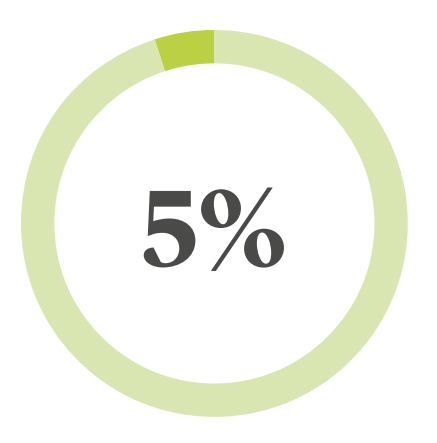
will leave employment due to a caring role

Staff members affected are usually in the 45-65 age bracket, and at the peak of their working careers. Recognising there could be a big impact upon your wellbeing and your work, your employer has put this support in place. If you found yourself in